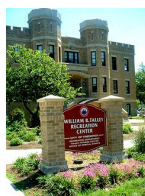
WILLIAM R. TALLEY RECREATION CENTER Located at: 121 North Bentz Street Frederick, MD 21701

P.S. Whether you join us or not, when out running don't forget to wear your reflective clothing and gear.